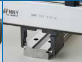
Distance between V slots on both sides of linear guide