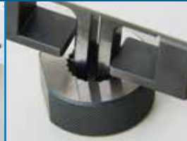
Simple measuring for root diameter of internal gear with odd teeth