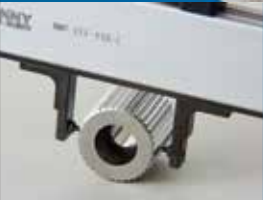
OBD of external splines