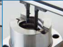
Three-point measuring method for internal pitch diameter of ball screw nuts

NMP Dial Caliper Gauge - the answer to your problems: