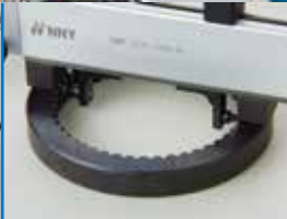
BBD of internal splines