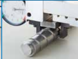
Three-point measuring method for external pitch diameter of ball screws